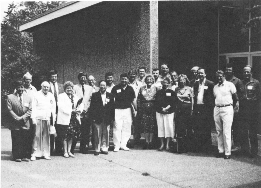
Members of the National Council of the Royal Astronomical Society of Canada at the Victoria General Assembly.