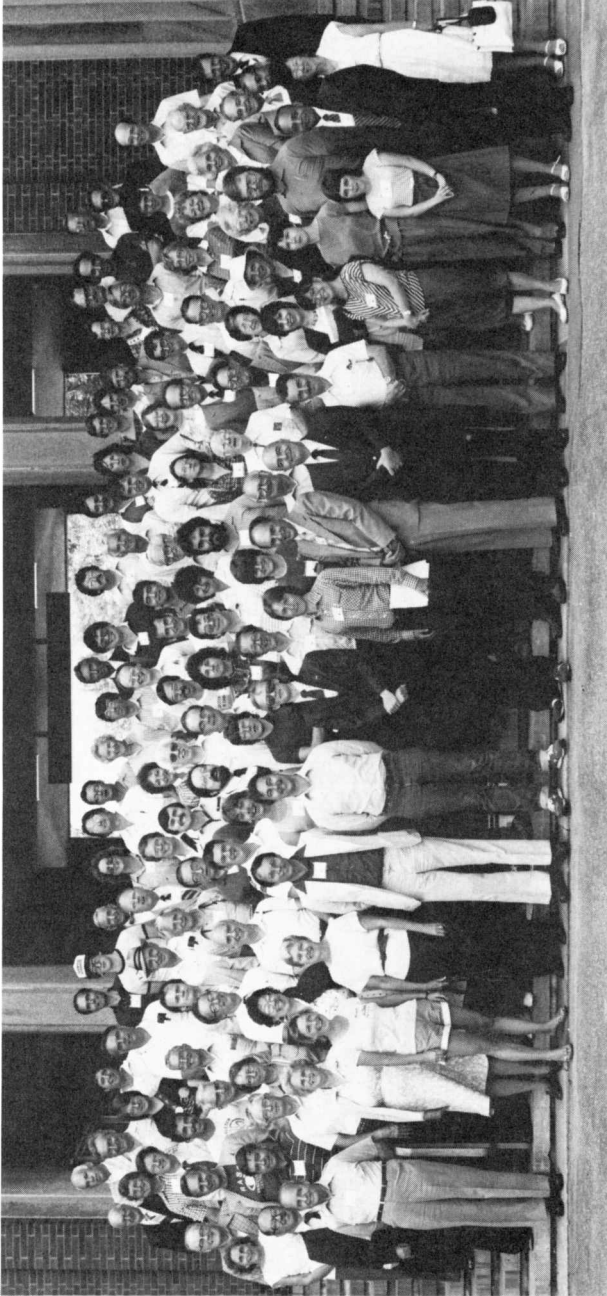
Group photograph of the delegates to the Society's General Assembly held at McMaster University.