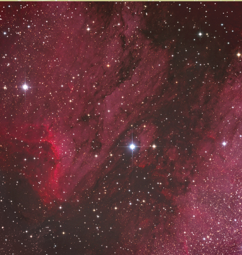
CALDWELL 20 , part of the Pelican Nebula, fills a vast area of the late-fall sky. This image is an Ha+LRGB blend jpeg (tiff available for print file). It was taken over three nights for about 10 hours total using a modified Ceravolo f/4.9 1800mm carbon fibre scope guided on a Paramount ME mount. The CCD camera was a Moravian G4-16000EC with Astrodon filters.