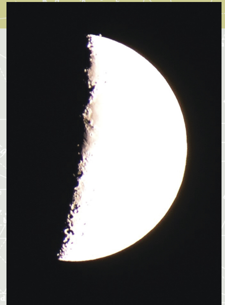
Aldebaran is seen very close to the Moon in this 1/30-second exposure, which was taken roughly four minutes after the graze event with a 300mm zoom lens on a handheld Nikon D3400 camera.

We were all delighted by the event. It exceeded my expectations and was well