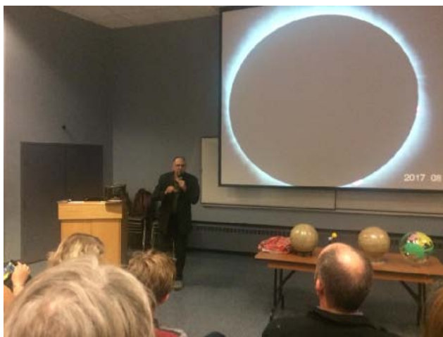
October 16.