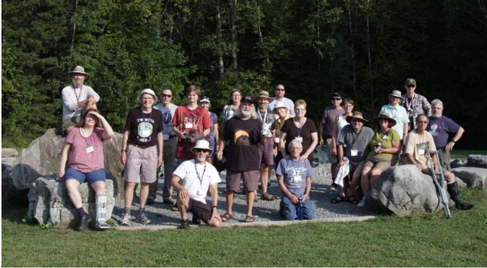
Group photo