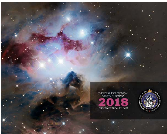
NEW Item: Observer's Calendar 2018

A beautiful calendar showcasing RASC members' astro-images with information on what's up in the sky tonight. A perfect gift for the beginner and a must-have for the experienced observer. Now available for pre-order!