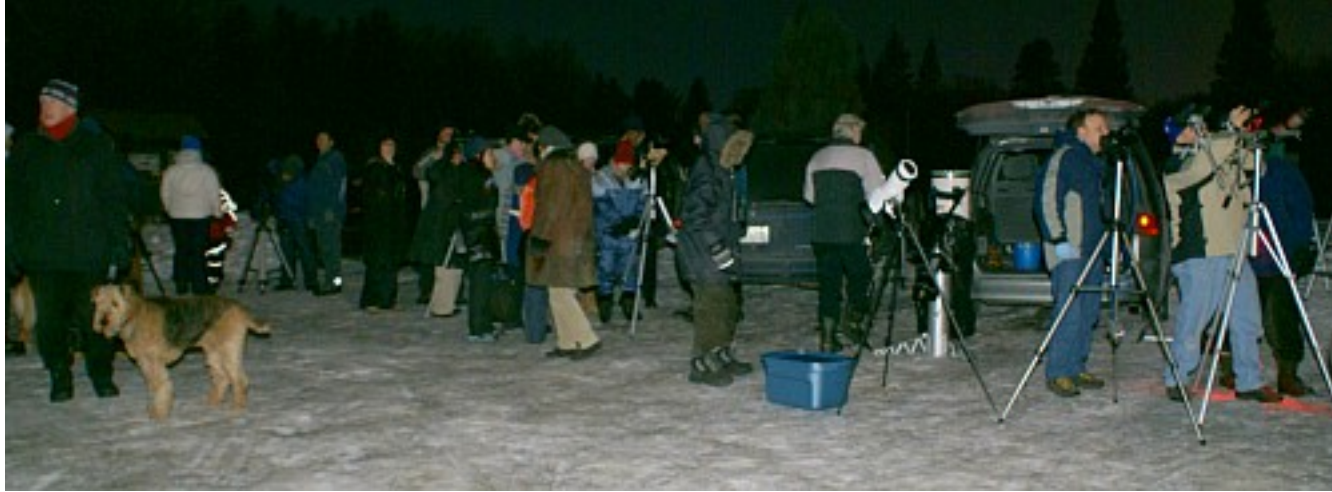
Montreal Centre members show off the Moon, Photo by Ron Baran