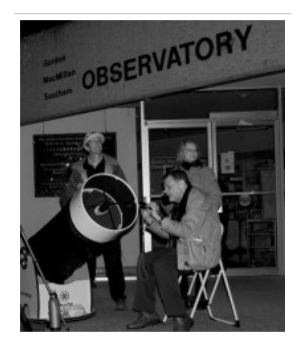
Vancouver Centre members take in the August 28th lunar eclipse.