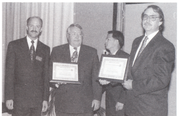
Representatives from both the Alberta Transportation and Utilities Department and TransAlta Utilities Corporation were on hand to receive the 1996 National Award for Responsible Lighting. Let us hope that more utility companies follow their lead.