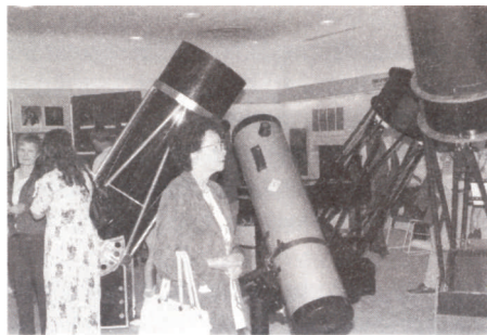
The display area featured many exhibits, the most prominent being the beautifully crafted telescopes that dominated the room.

The council met at 1:00 PM in the university board room—a very cool place for a meeting. They had microphones and switches for electronic voting at each seat! I had to leave at 3:00,