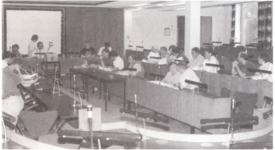
One of the national council meetings that were held during the General Assembly, or possibly the morning session that was not held!