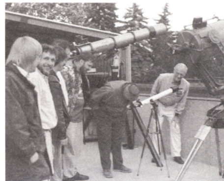
At the ESSC observing deck, RASC members with a nose for quality, line up to wait for their turn at the Tasco refractor.