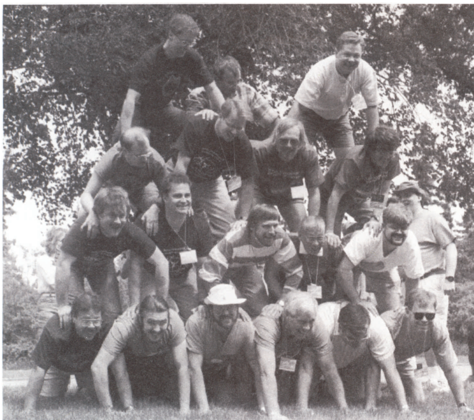
A G.A. would not be the same without a pyramid. With a bit more speed this year a fifth layer would have been possible. Five layers will be the goal in Kingston. All photos accompanying this article were taken by David Lane, or at least taken using his camera!

The ESSC site is a V-shaped building with roll-off roofs. It houses an impressive collection of telescopes including two C8's, a C14, a four-