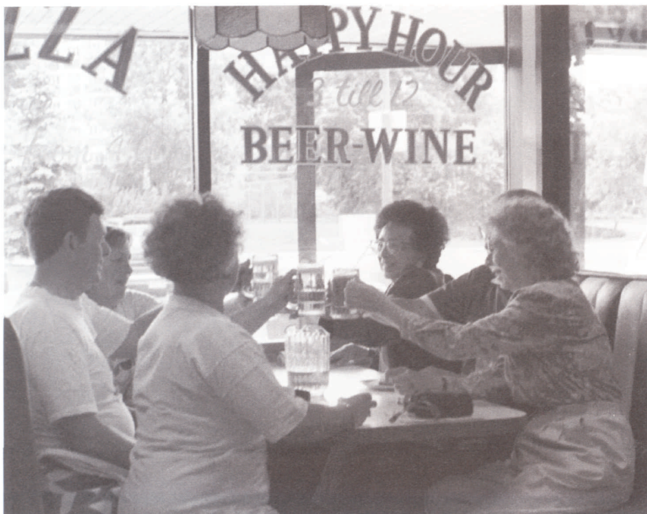
The area around the university provided a number of suitable places to have lunch!

The Montreal Centre offered to host the fall meeting of the national council, which is tentatively scheduled for Saturday, October 19th. ☺