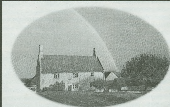
WOOLSTHORPE MANOR Birthplace of Isaac Newton