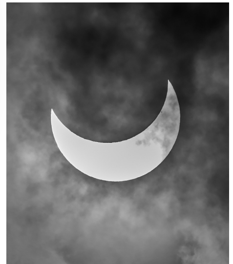
PARTIAL SOLAR ECLIPSE

If you plan to use a telescope or binoculars to view the event, you'll need a specialized filter designed to fit over the front aperture of the instrument. Never use eclipse glasses intended for naked-eye viewing in conjunction with any optical device!