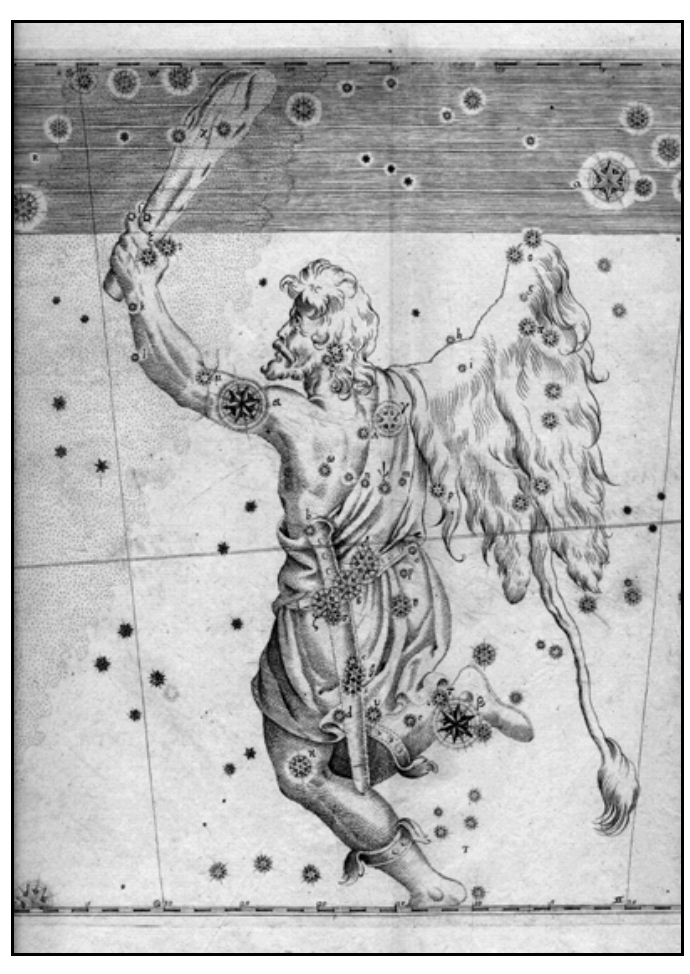
From Johann Bayer's "Uranometria" copper engraving.

Even today the names of these stellar heroes, heroines, animals and objects haunt many aspects of our culture. Most daily newspapers carry astrology columns and almost everyone knows the 'sign' under which they were born, the constellation in which the sun resided at the time of their birth. Even NASA acknowledges the great hunter as a spacecraft, now in development and called Orion, will be used by NASA to return men to the moon in 2020 after a long hiatus.